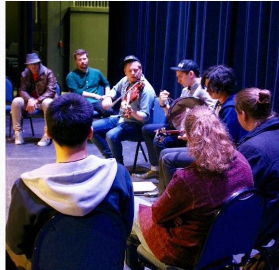
Ten Strings and a Goat Skin Master Class