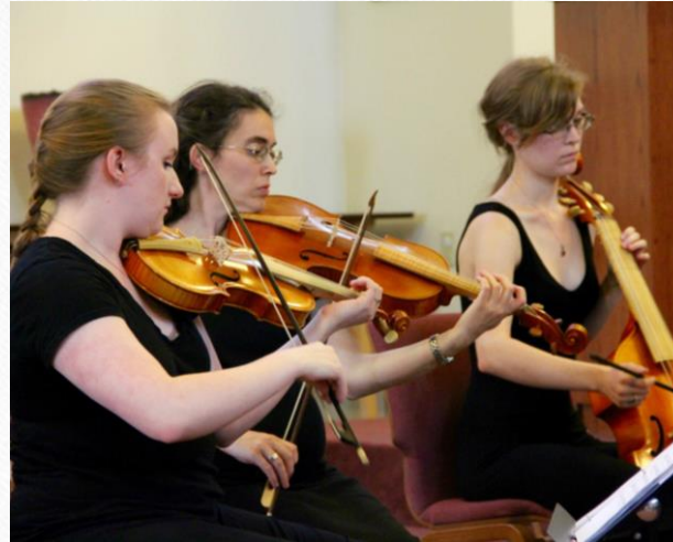
WOU Early Music Ensemble

WOU Early Music Ensemble, WOU Saxophone Quartet, WOU Brass Quintet, Smaller Instrumental Ensembles: Brass Quintet, Trumpet Ensemble, Piano Trio, String Quartet, Flute Choir, Woodwind Quintet, Clarinet Choir, Saxophone Quartet, Horn Quartet