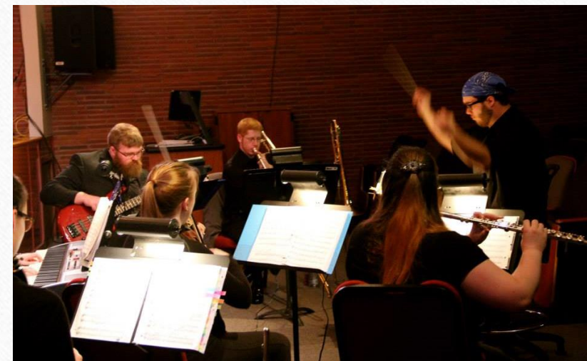
Pirates of Penzance