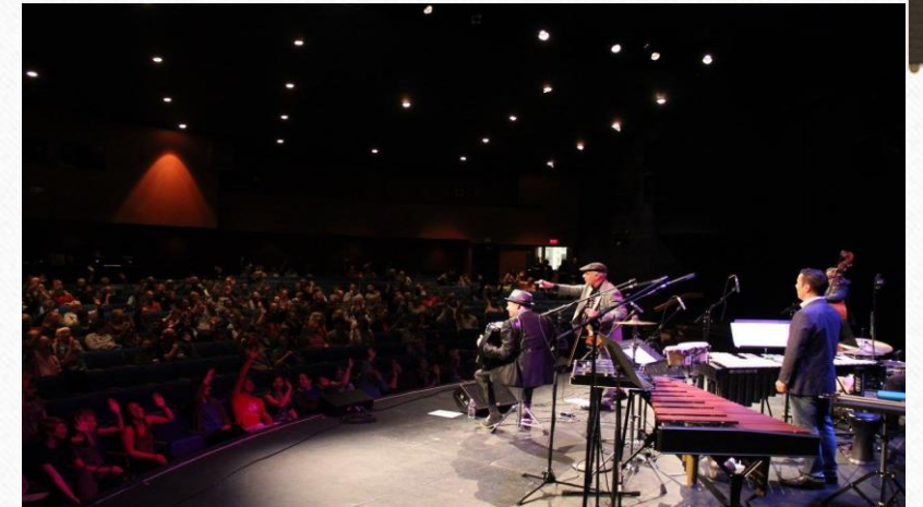
3 Leg Torso Performance