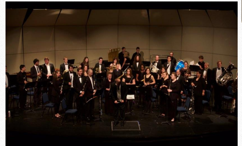
WOU Symphony/Wind Ensemble