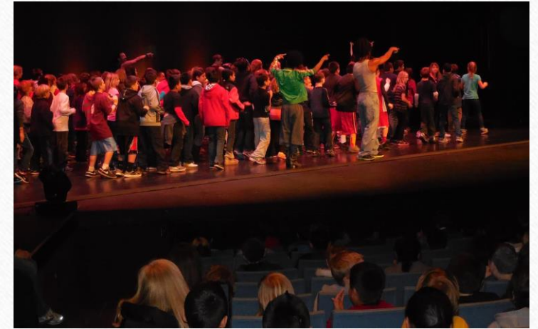
Rainbow Dance Theatre Education Outreach