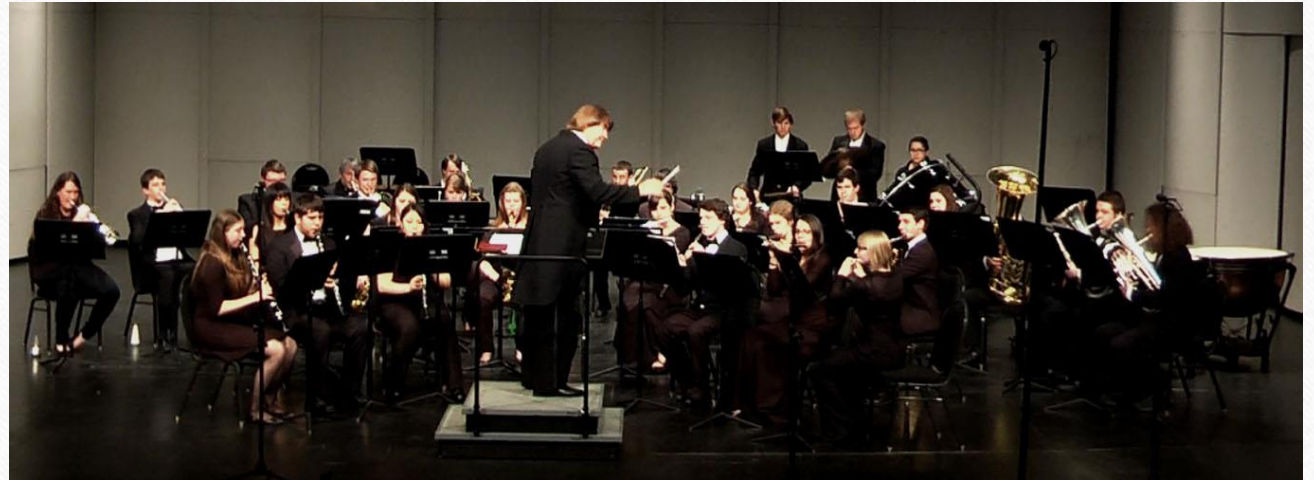
WOU Symphony/Wind Ensemble

Travel for regional performances and conferences