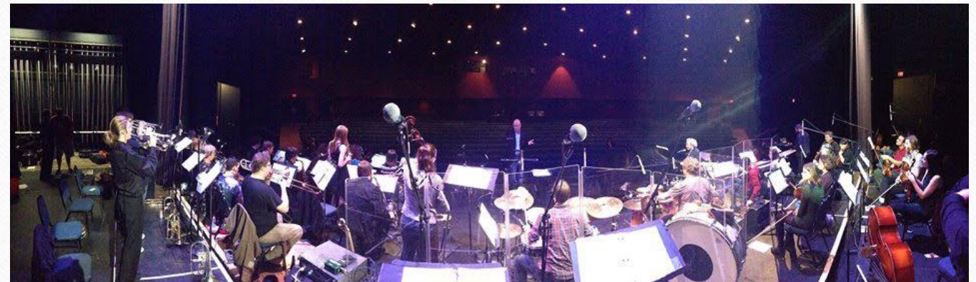
Western Hemisphere Orchestra Performing w/Allen Toussiant