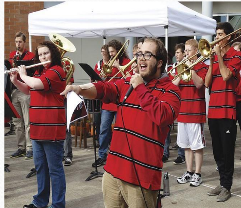
WOU Pep Band