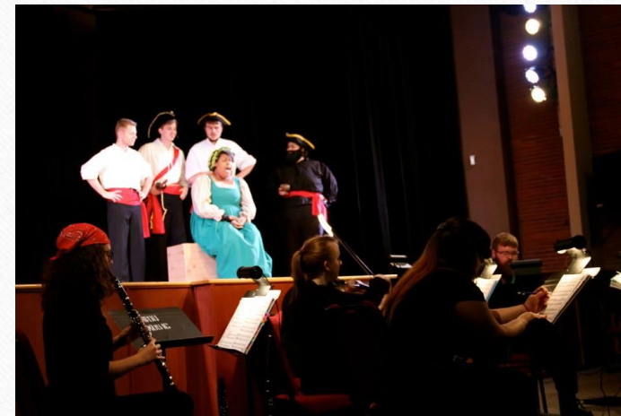
Pirates of Penzance