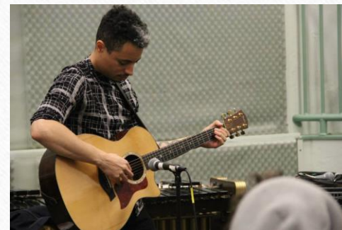
Jose James Master Class