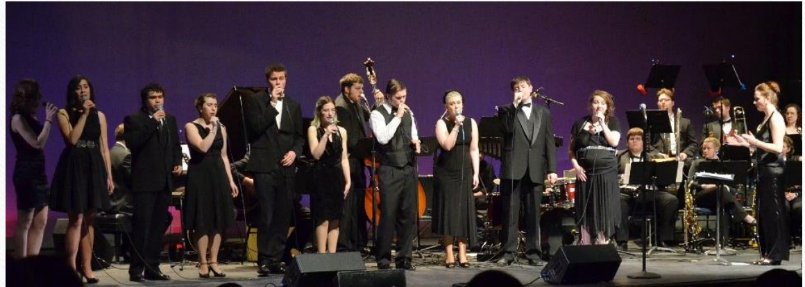
Western Hemisphere Voices