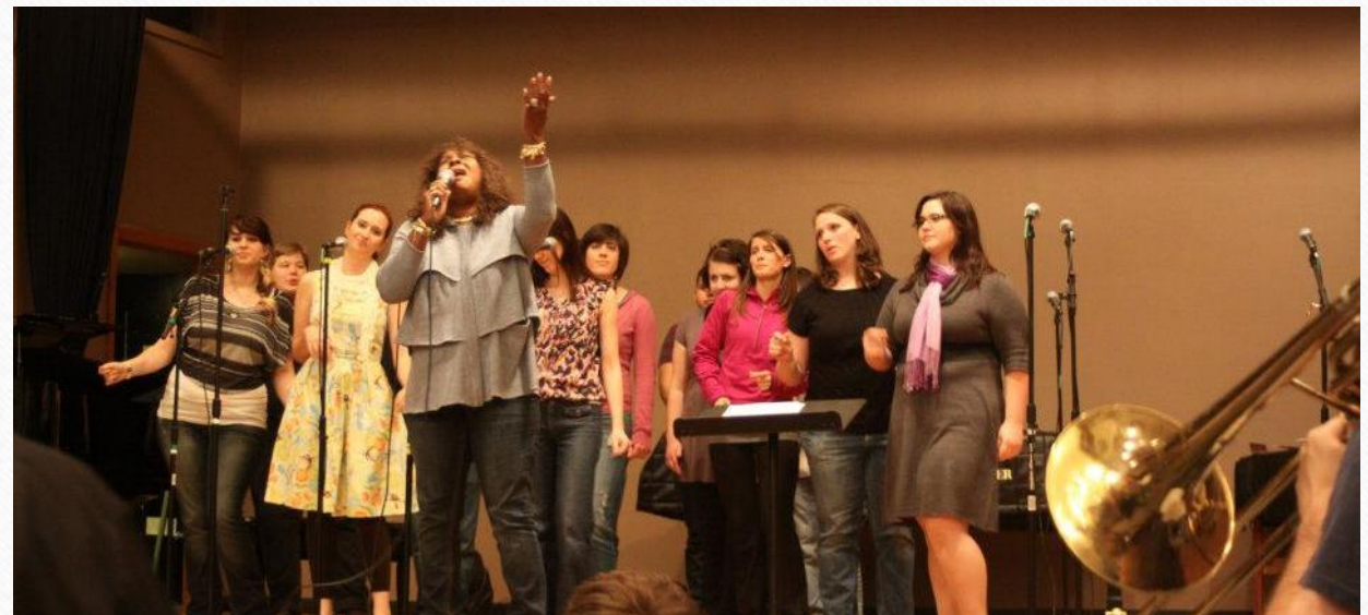
Western Hemisphere Voices Performing w/Martha Reeves