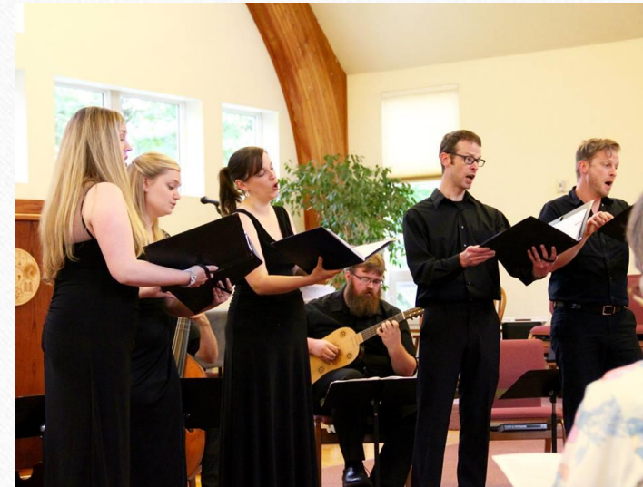
WOU Early Music Ensemble